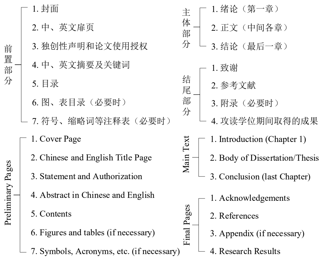
图 1-1 学位论文基本结构 Figure 1-1 Basic Structure of a Degree Dissertation/Thesis

The dissertation/thesis consists of three main parts: the preliminary pages, the body of text and the final pages, the composition and order of which are shown in Figure 1-1.